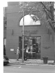
Literacy Council of Frederick County 110 E. Patrick St.

Anniversary Celebration — Fall of 2013, stay tuned for details!