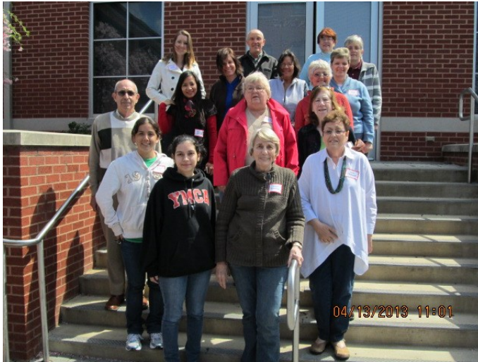
Photo of recent graduates taken outside the C.Burr Artz Library

These future tutors recently graduated as certified tutors from the Frederick workshop. Below that is a list of graduates who completed and were certified at the Hagerstown Workshop.